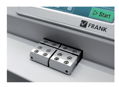
Open design allows samples to be easily placed