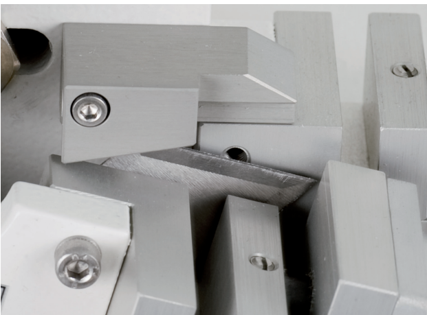
Inbuilt blade cuts in the samples fully automated