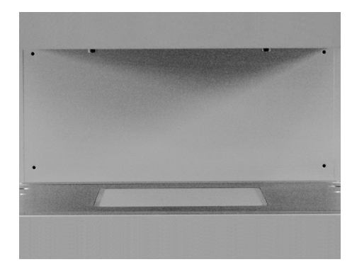
Transmitted light unit with opal glass