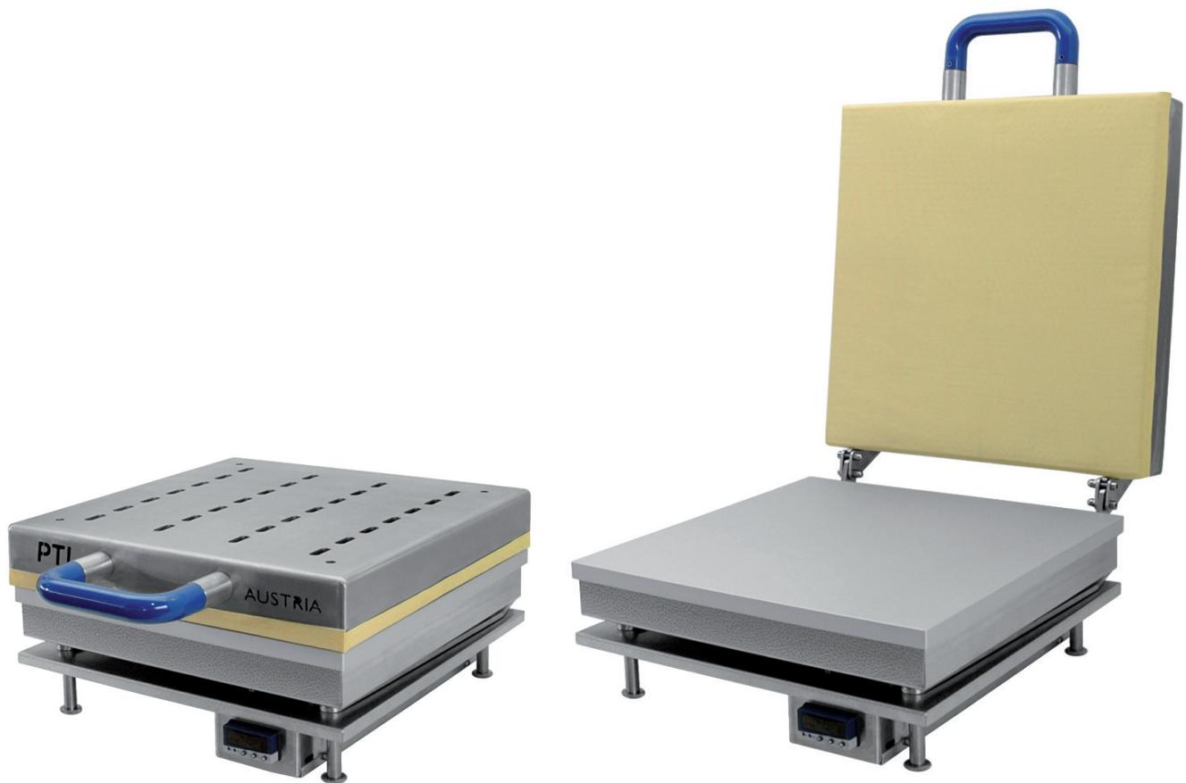
Model with a plate size of 350 x 350 mm