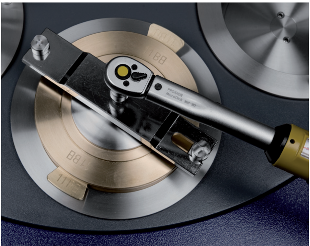
Fixing the grinding vessel sets with a torque wrench