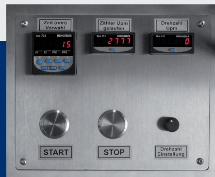
Digital control I unit