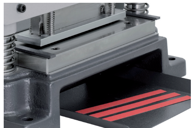
Metal sheet for easy removing of the samples